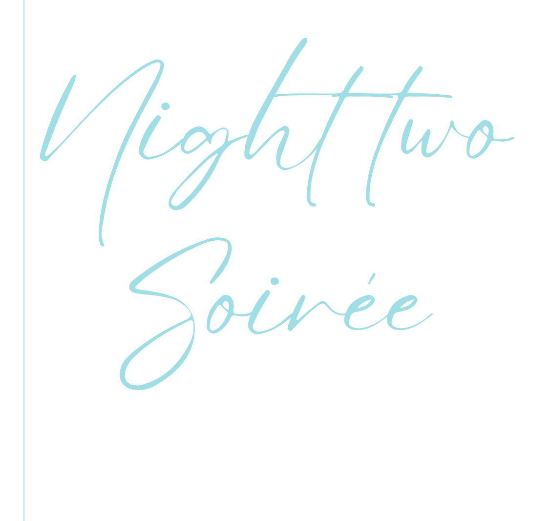
Feel like celebrating a little longer?

Continue the celebrations in The Lake, we have many options available; lunch for the bride & groom's parents, buffet options, and private room hire.